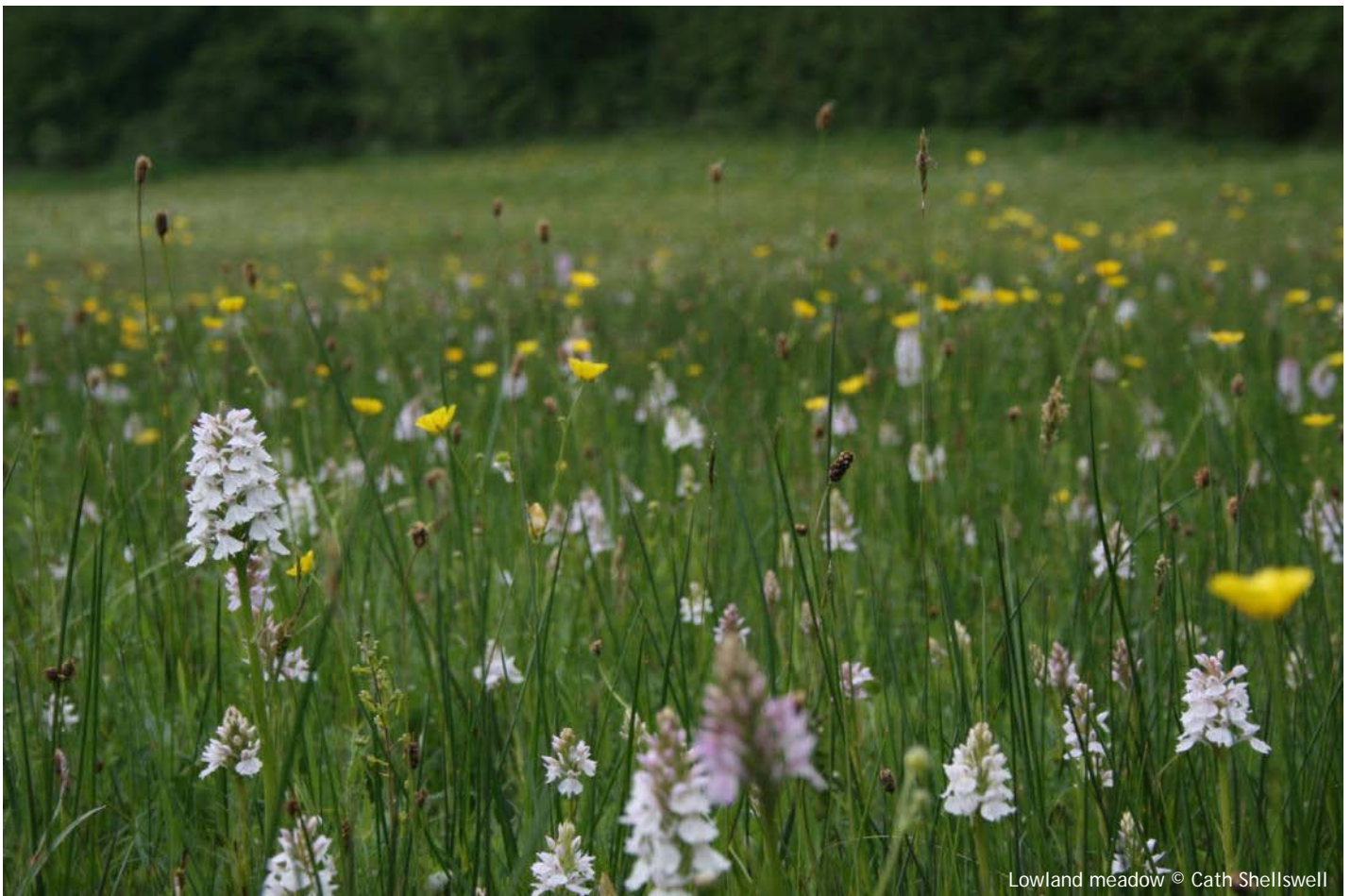
Lowland meadow