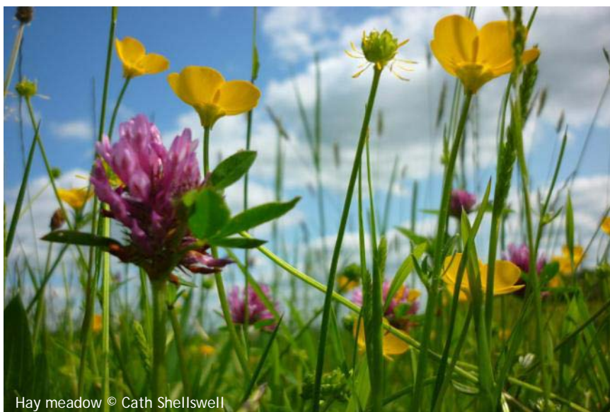
Hay meadow