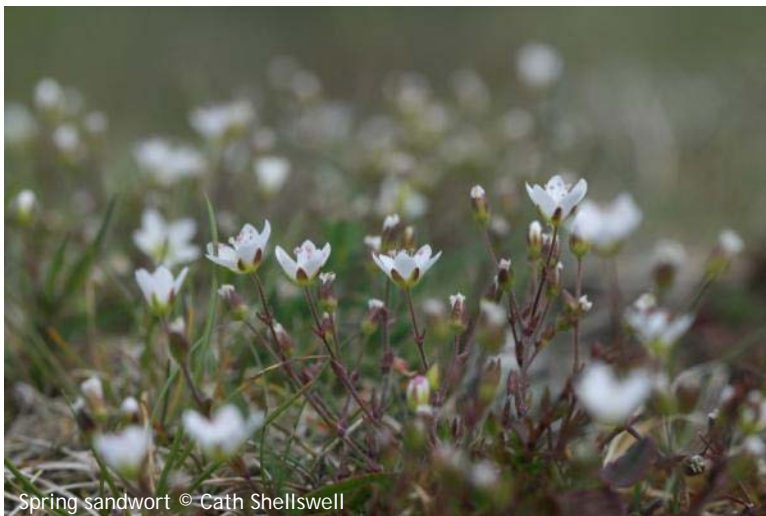
Spring sandwort