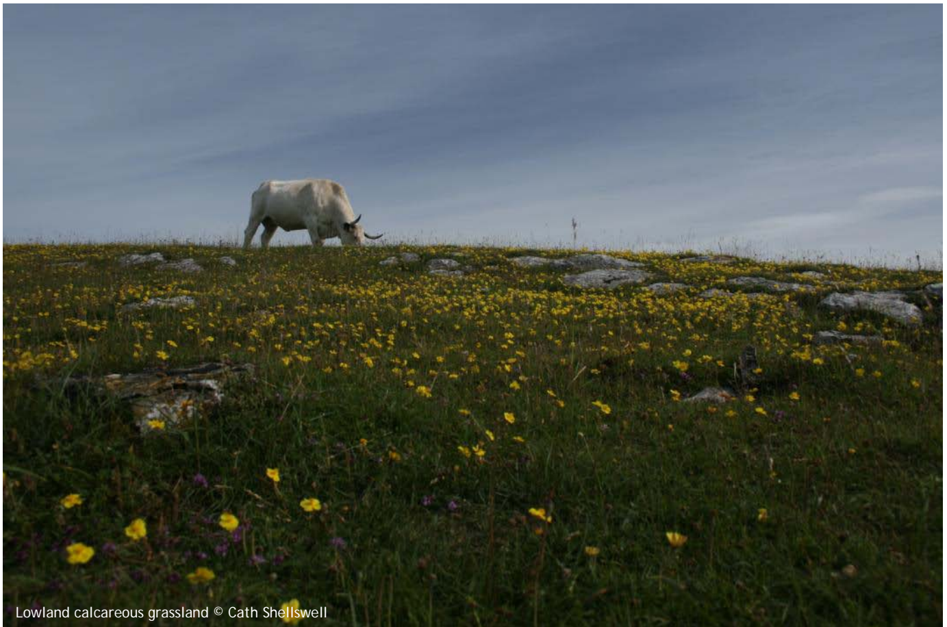
Lowland calcareous grassland