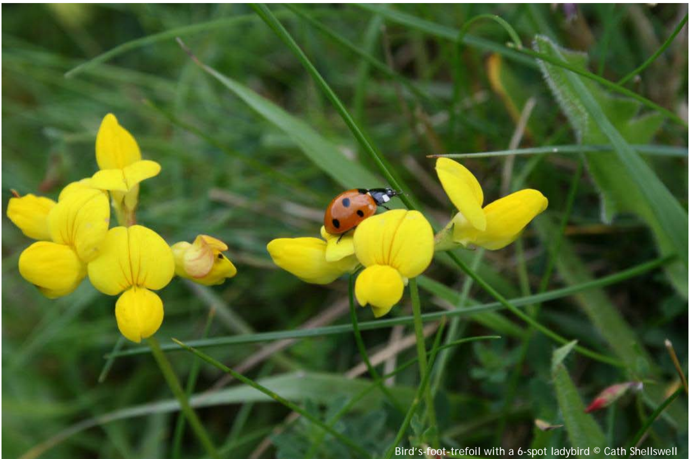
Bird's-foot-trefoil with a 6-spot ladybird

Magnificent Meadows would like to thank Natural England for allowing much of this information to be reproduced from their Baseline Evaluation of Higher Tier Agreements Manual (BHETA Manual) for Countryside Stewardship applications (Second edition May 2016).